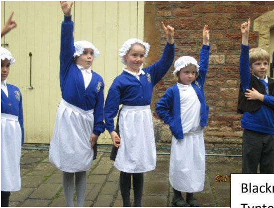
Blackrock Class visited Tyntesfield for a Victorian Day.