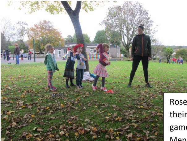
Rosewood hosted their own highland games and joined Mendip Class for a Ceilidh dance.